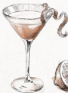
SIDE CAR 135 Cognac, Cointreau, lemon