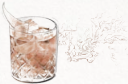
MAGUEY OLD FASHIONED 90 Tequila reposado, Mezcal, agave nectar, Angostura and orange bitters