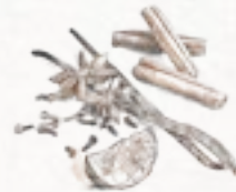
DARK & STORMY 78 Dark rum, lime, ginger beer, brown sugar, Angostura