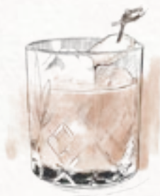
PENICILLIN 115 Blended scotch whisky, Islay whisky lemon, ginger honey mix